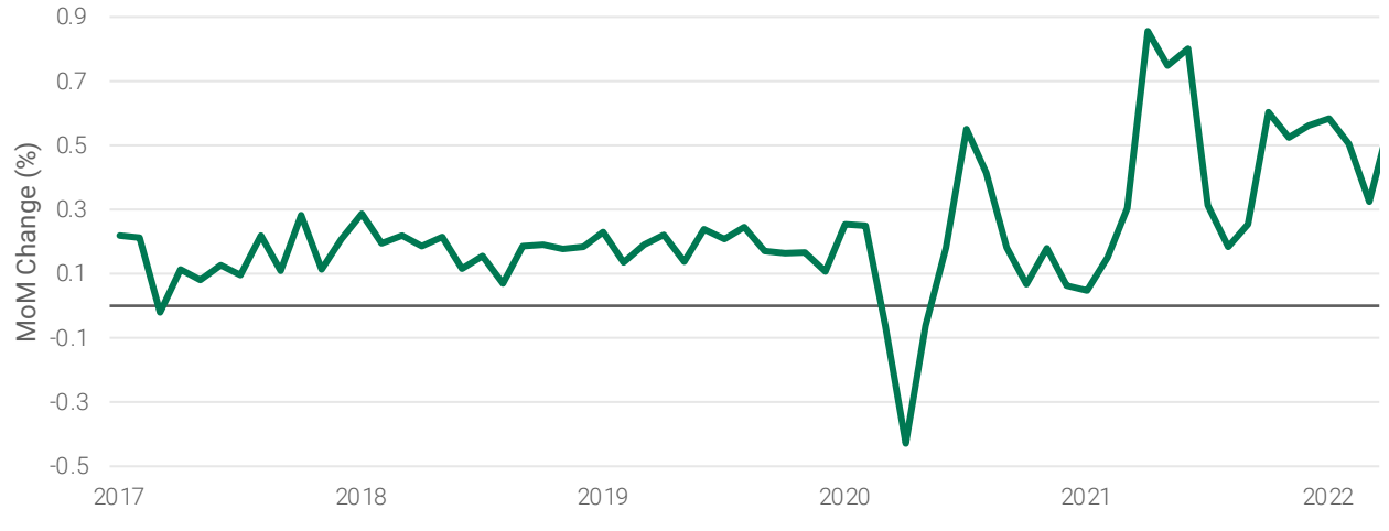
Figure 3 | U.S. Inflation – Core CPI

We believe there are early indications that inflationary pressures are starting to wane. For example, Figure 3 shows how monthly U.S. CPI less food and energy appears to be past its peak levels.