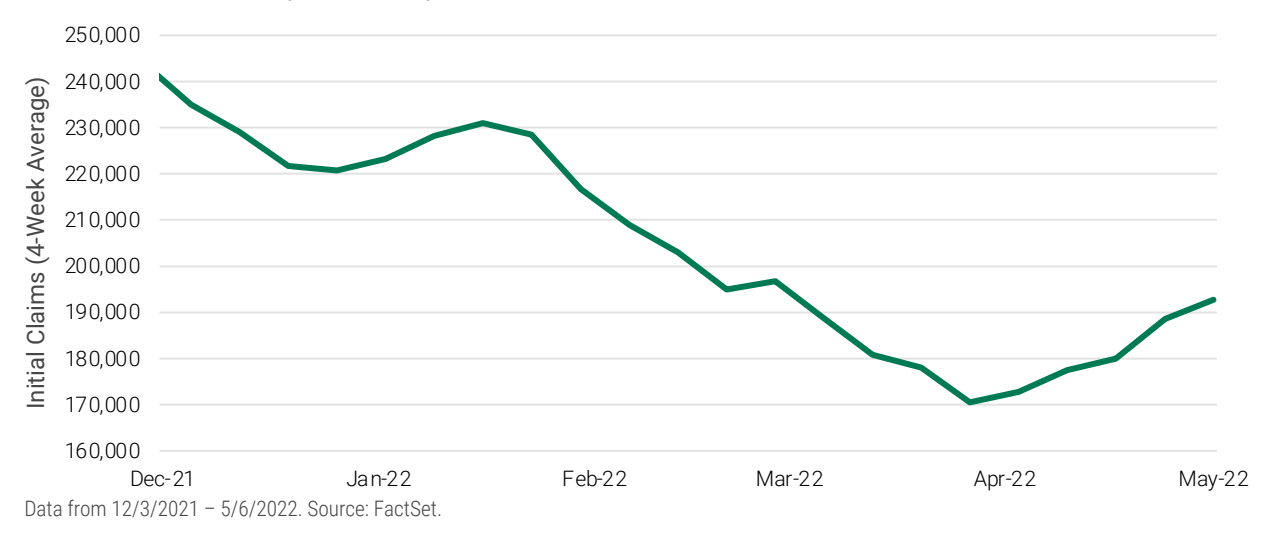
Figure 5 | U.S. Weekly Unemployment Claims

In the labor markets, the availability of workers remains tight but the four-week average for unemployment claims has recently ticked up. Similarly, ADP reported that small business hiring has started to slow after strong hiring growth over the last few years. We've also seen some layoffs or hiring freezes announced at tech companies such as Carvana, Vroom and Twitter.