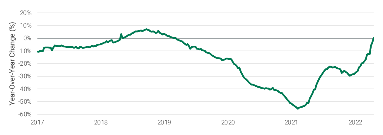
Figure 6 | Weekly Active Listings

For example, mortgage rates have begun to rise, and we've seen evidence that tight housing inventories may be loosening. In absolute terms, the number of available houses remains low compared to historical trends. However, Figure 6 shows that the growth of active listings on a year-over-year basis has turned up compared to nearly three years of decline.